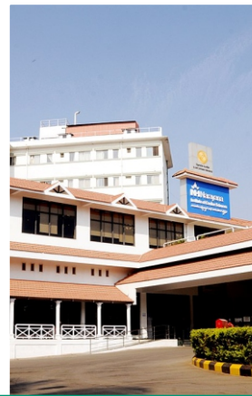
Narayana Hrudayalaya Hospital