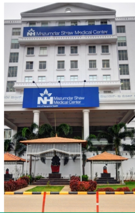
Mazumdar Shaw Medical Center